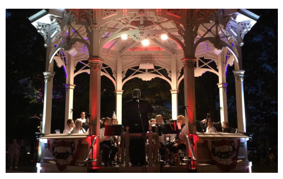
Medina Community Band – To provide operating expenses for the costs of presenting 8-10 concerts a year.