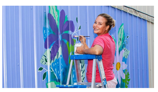
Main Street Wadsworth/Downtown Wadsworth – To secure the services of a professional artist who will design and create an art mural in downtown Wadsworth.

Integrated Community Solutions – To pay for a guest artist instructor once a month for one year for this organization that provides programming for children, teens and adults living with developmental disabilities.