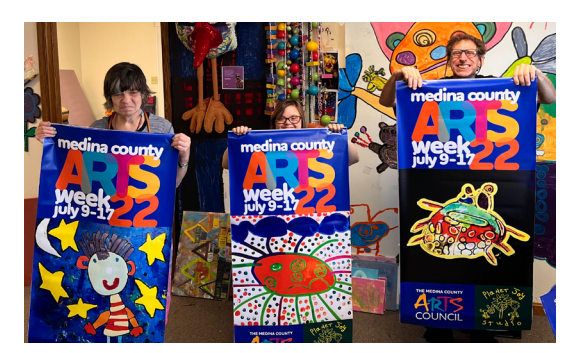
Planet Joy Studio/Peaceworks – To support operating costs such as supplies to help empower artists to expand their creativity skills and art mediums.

Medina Chorus – For operating expenses to include purchase of music, director and accompanist fees, rehearsal and performance hall rental.